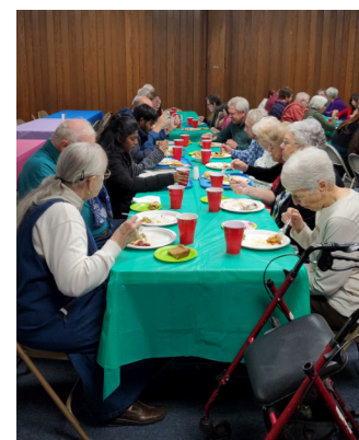
Members and visitors enjoy a special meal after the worship service