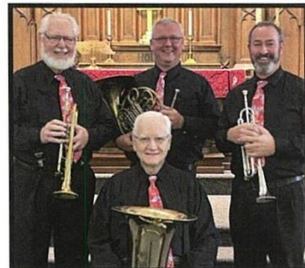
10th Street Brass

10th Street Brass will share holiday music prior to the concert.