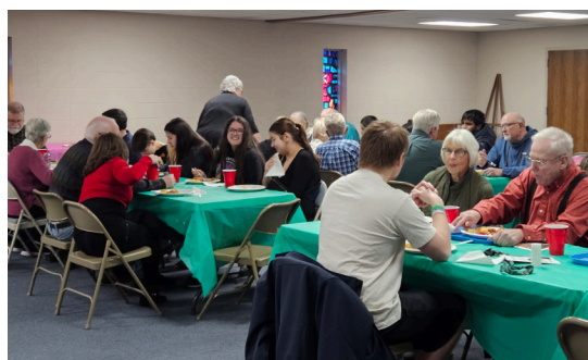
Members and visitors alike enjoyed several casseroles and desserts at Sunday's post-Advent worship potluck lunch prepared by the Christian Life Team.