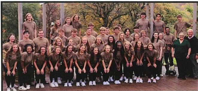
Maryville High School Spectrum