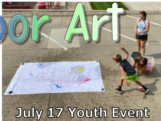
July 17 Youth Event